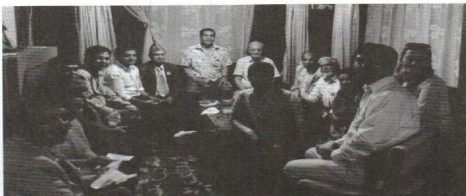
Ad Hoc Committee Members of the South Asian Regional Horticulture Society.