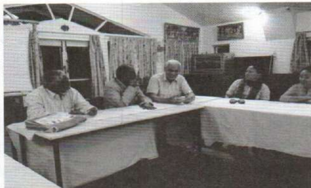
SAARC country representatives discussing the need of a South Asian Regional Horticulture Society.