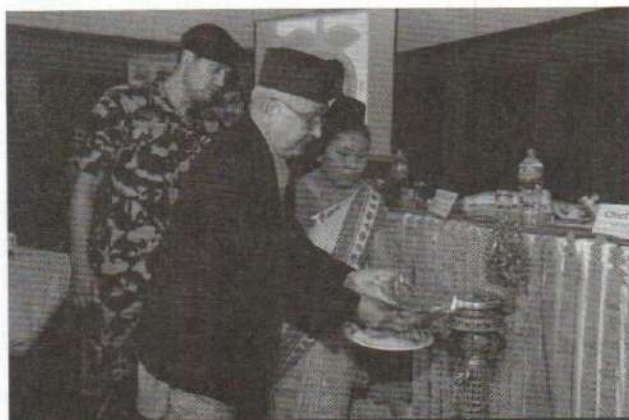
Chief Guest Rt Hon. Prime Minister inaugurating the conference by lighting the panas