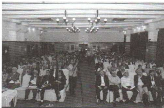
Participants on the inauguration ceremony of the conference