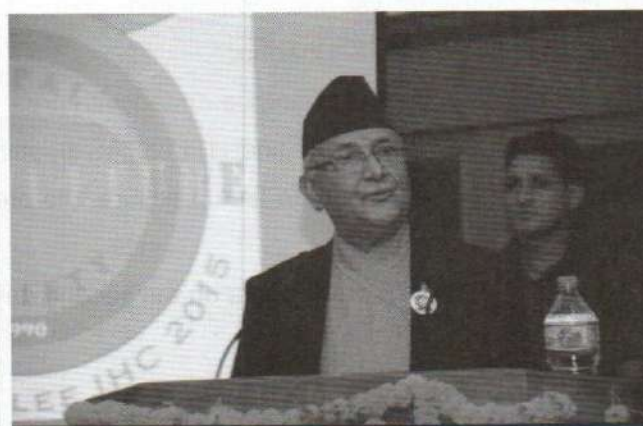
Chief Guest addressing the participants