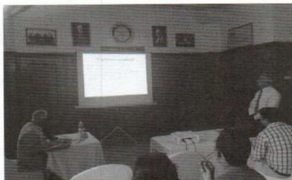
Representative from RRN presenting their contribution in horticulture development of Nepal

There were about 175 participants on the third day.